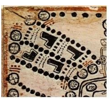
Above is the Mayan Madrid codex of the Tzolk'in clock, showing the Light trecena and the Reed trecena on the east-north corner of the Tzok'in clock

Left is the Aztec Fejervary codex of the Tzolk'in clock.