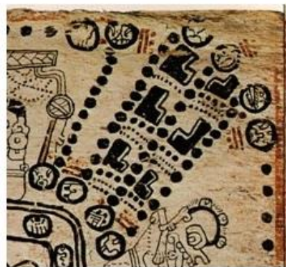
The northwest corner of the Tzolk'in from the Fejervary and Madrid codices