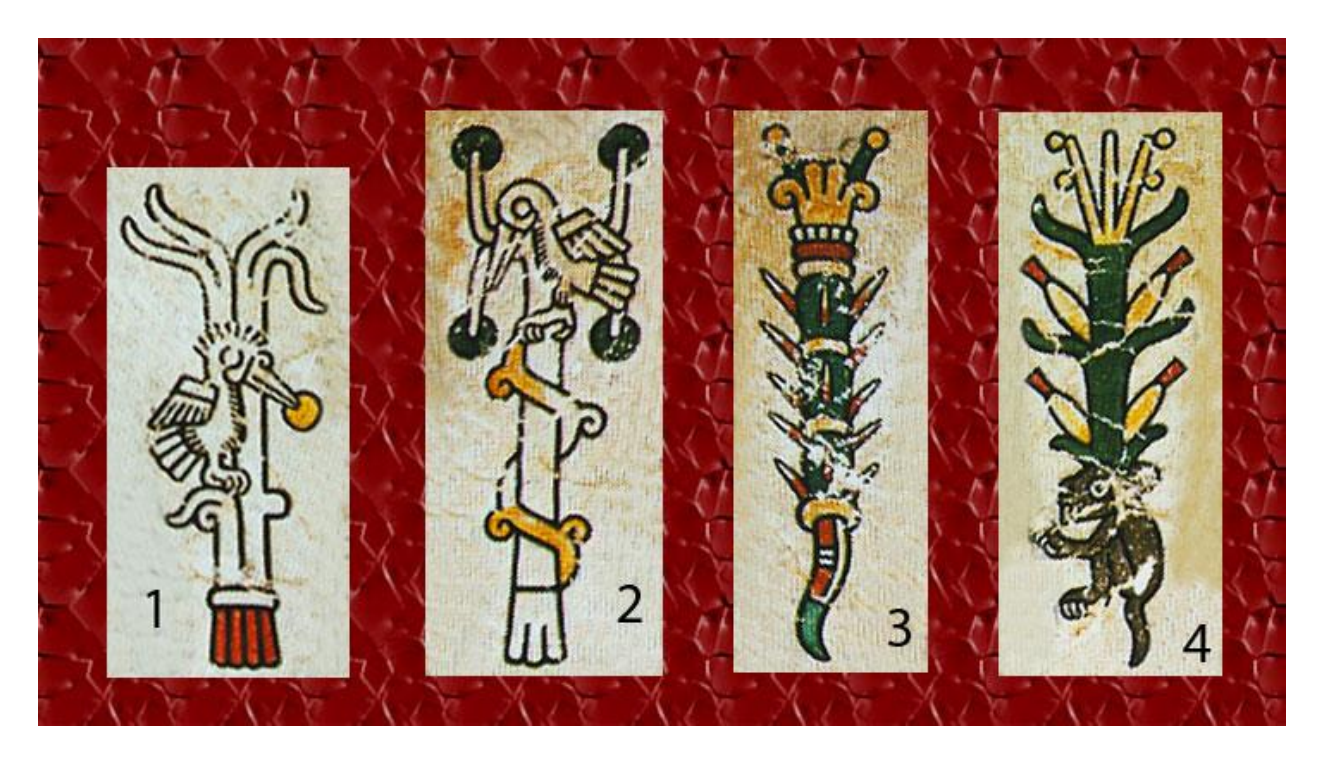
The 4 phases of seeds to fruit shown on the Aztec Tzolk'in

The mental relation of the Tzolk'in Clock has the water trecena crossing the left side of our brain. The left side of our brain controls language, logic, mathematics, reasoning, and our five senses. The Tzolk'in Clock is telling us that it is time to use these facilities. This is the time to harvest the seeds we planted on the east face of the Tzolk'in Clock. It is also the time to start thinking about the new seeds we will plant.