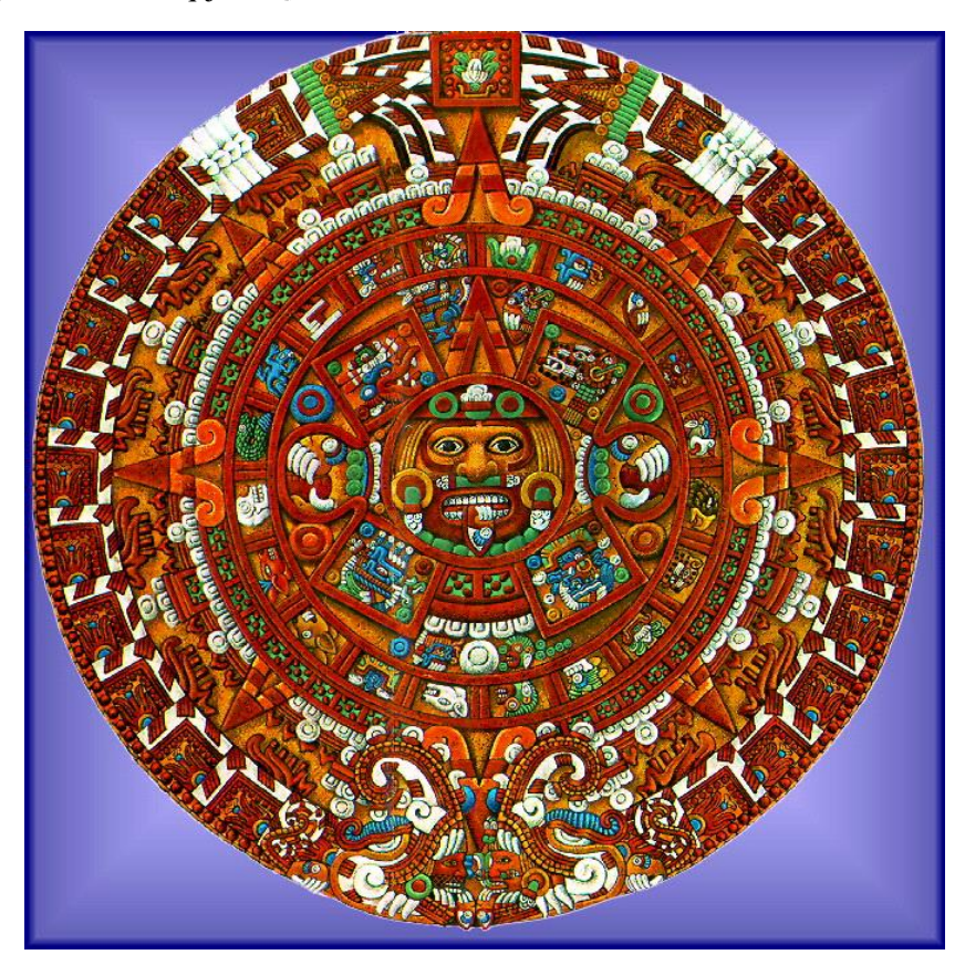
Your Tzolk'in birthday

The Tzolk'in Clock is embedded in the Aztec sun calendar (which has been misrepresented). The face in the center is not a blood thirsty sun. The face in the center is mother earth and she is speaking to us. She is speaking the message of the Tzolk'in to you, right now. The sun is not speaking. It is hidden as an eagle, which flies above us. You can see the eagle, in the center of this calendar, with its beak on top, claws on the side and feathers on the bottom. The sun flies over earth like an eagle. This video goes into excellent details. (https://youtu.be/0b9vqrjK2lQ).